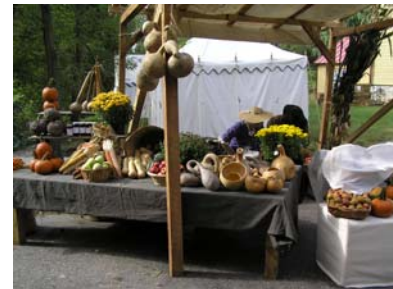
Delaware Grown Produce

Rope Makers Poet Lace Seller Cooks Carpenters Spinners and Weavers 18th Century Farmers