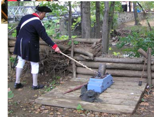
Artillery and Military Engineering Demonstrations

Spectators stand in the rain to watch militia recruits drill.