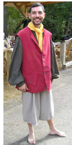
Join A Privateer

The three-day event offered visitors the opportunity to Experience life in 18th Century Delaware at the time the American and French forces made their march from Rhode Island to Yorktown. In 2006, over 1000 visitors joined 128 reenactors, craftsmen, historical interpreters, and musicians at Greenbank Mill & Philips Farm to celebrate our Revolutionary Heritage.