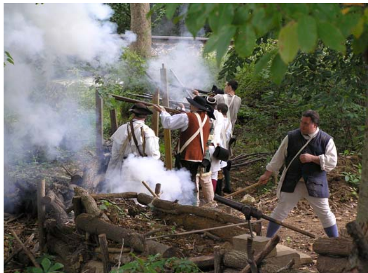
Militia Demonstrates Infantry & Artillery

Like in 1781, soldier and civilian lives mingled at Greenbank Mill & Philips Farm. Visitors were given the opportunity to explore civilian and military life and observe how they collided.