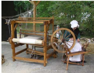
Spinning & Weaving